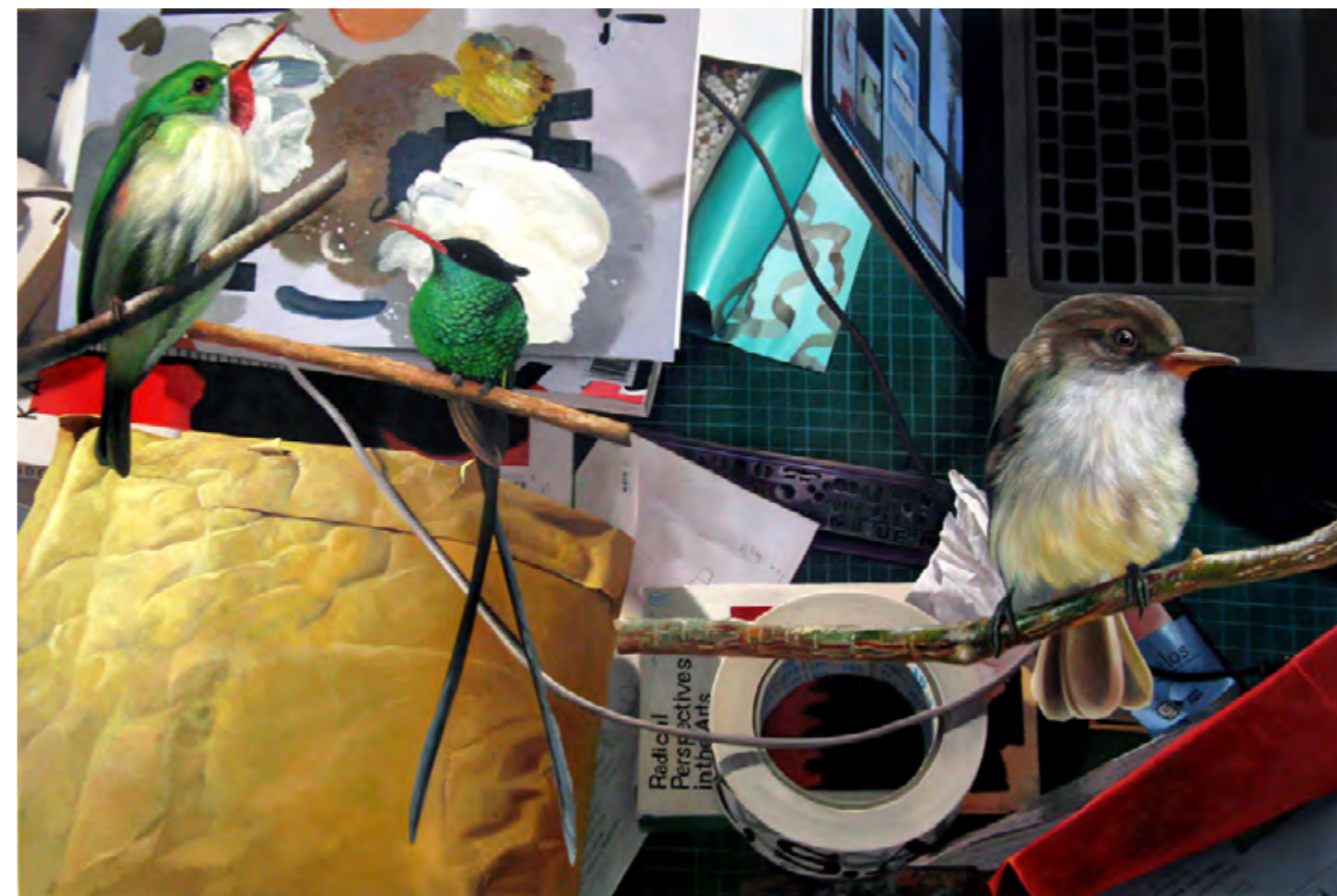
Macbook Pro, Carribean Birds and Radical Perspectives in the Arts Oil on canvas 120 x 180 cm 2012