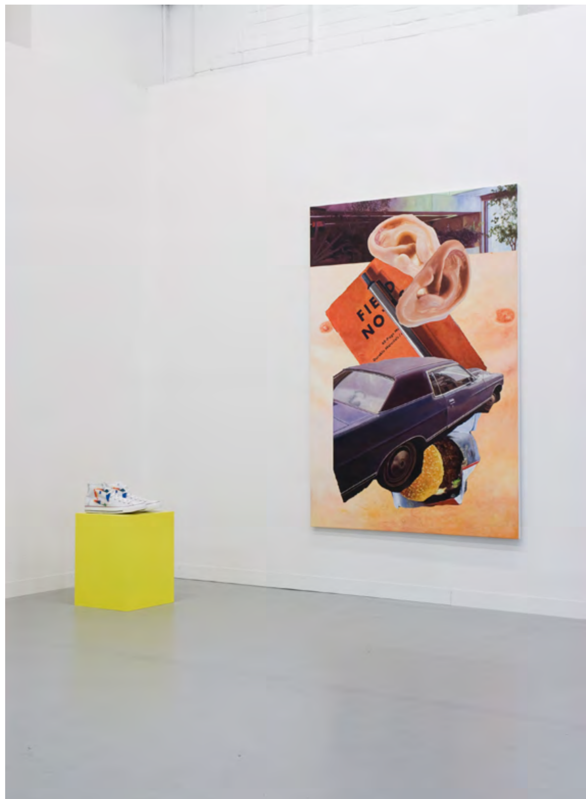
Enter Site Play Now Cry Later/Oil on canvas/180 x 120 cm/2013

A 3D painting where the artists expect the collector or the spectator to experiment the conceptuality of the work, both by living in the idea and theatricalizing the action of representation as well as becoming performers of the artwork. These series want to emphasize the life of the painting, because the goal is to venture into its concept (trip) and to experience it.