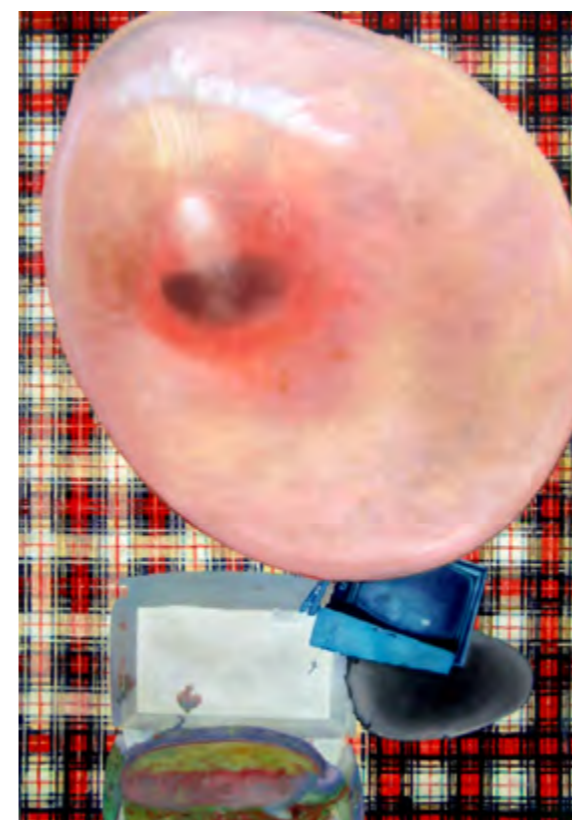
The untitled bubble, TV, rock, sandwich and tablecloth as still-life Oil on canvas 100 x 70 cm 2012