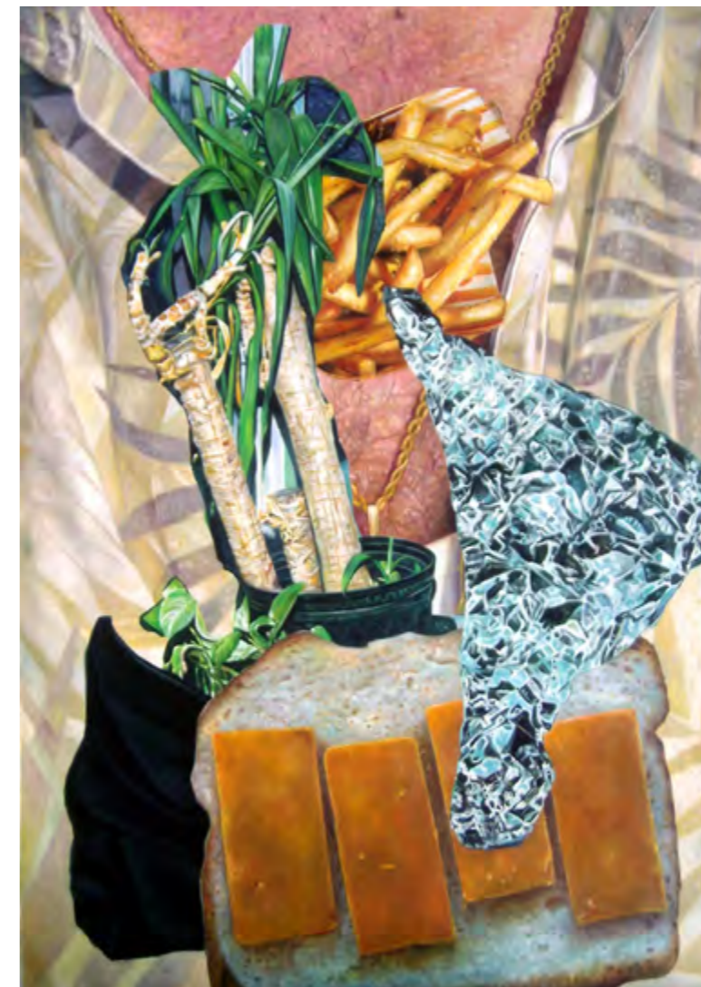
Fwd: Untitled Portrait Oil on canvas 180 x 120 cm 2013