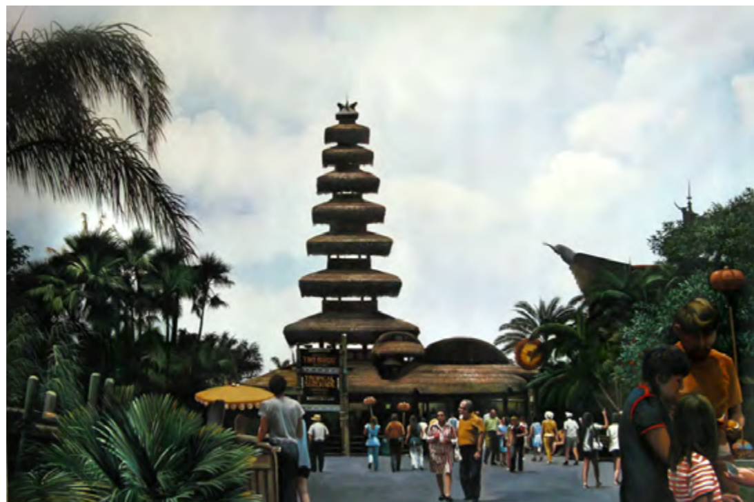
Tiki Room/Oil on canvas/120 x 180 cm/2012

An atmospheric novel played on speakers. Oil paintings. Pillows. 2012