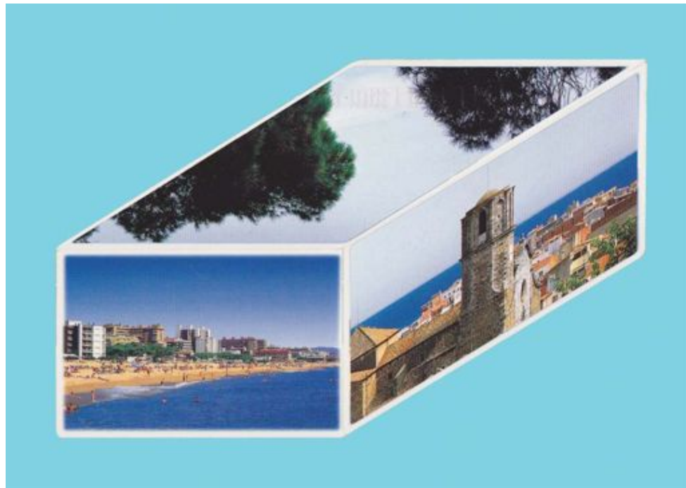
examples of final collages