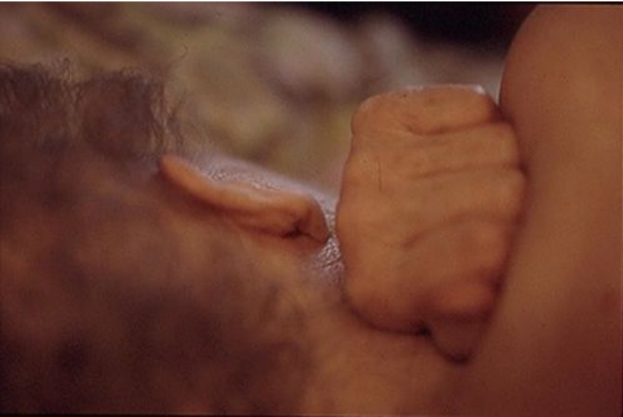
collage, performance, action Worldwide 2014