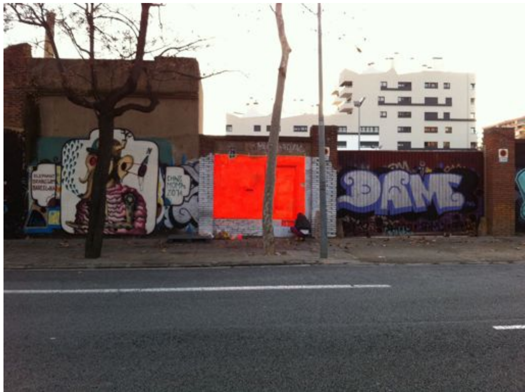
The open wall