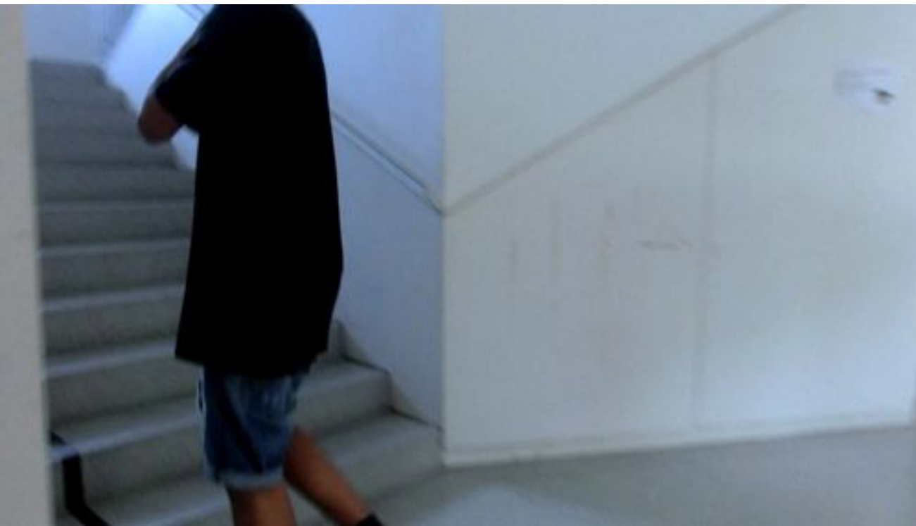
performance, action Spain 2015