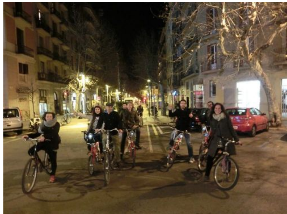
The Bicycle Tour